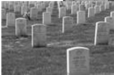
Arlington National Cemetery