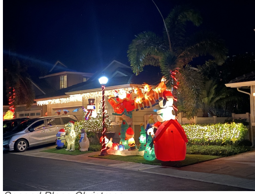
Second Place Christmas