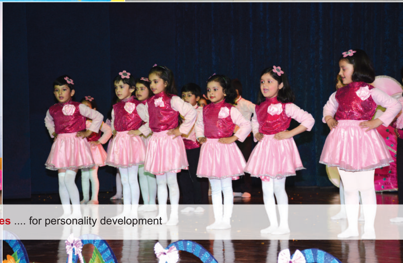
activities .... for personality development