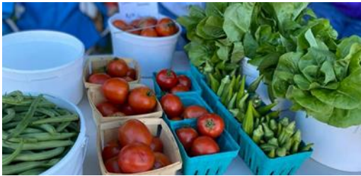
Cover photo compliments of Brie’s Backyard Bounty.