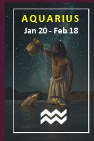
Poured like Water for Redeemed