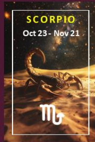
Faced the Adversary