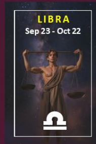
Judged on an Altar