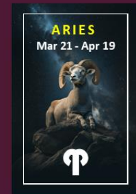
Was the Lamb of YHWH