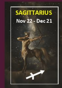
Conquered Enemy in Triumph