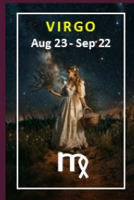
Born of a Virgin