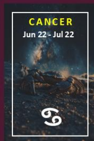
He gathers the Redeemed