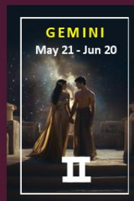
The Groom comes for Bride