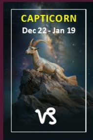
Was the Scape Goat