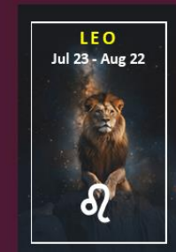
Is the Lion King Triumphant