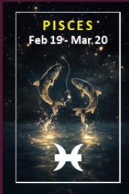
Breaks Band at Resurrection-Rapture