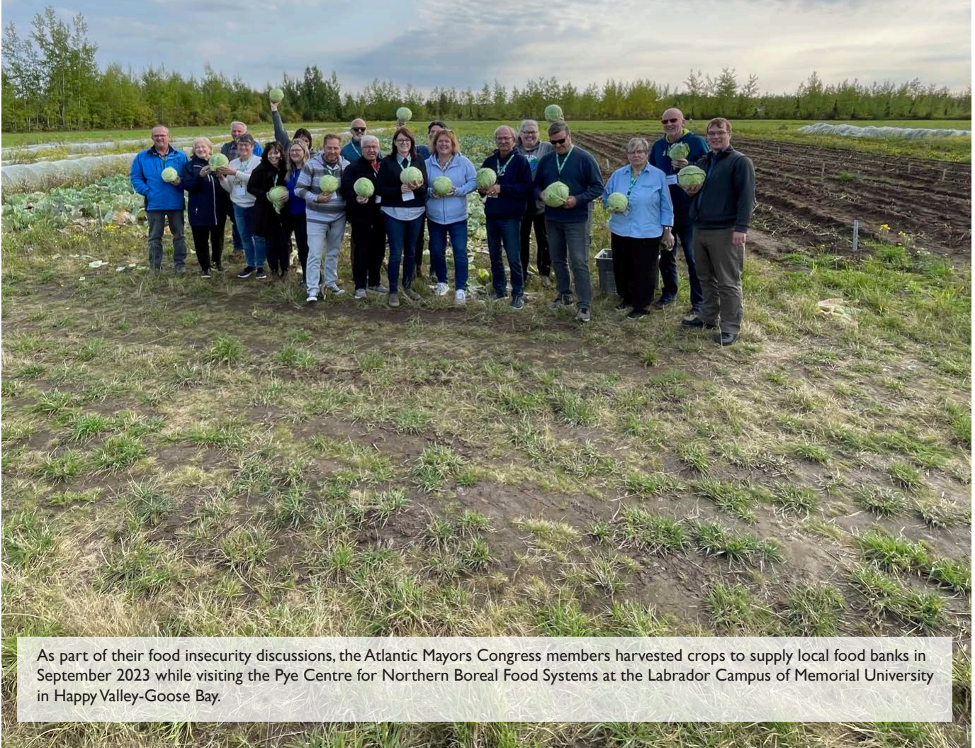
As part of their food insecurity discussions, the Atlantic Mayors Congress members harvested crops to supply local food banks in September 2023 while visiting the Pye Centre for Northern Boreal Food Systems at the Labrador Campus of Memorial University in Happy Valley-Goose Bay.

The Atlantic Mayors' Congress provides a forum for exchanging ideas and a unified voice for municipal leaders in Atlantic Canada to address significant issues.