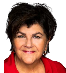
Hon. Gudie HUTCHINGS Minister of Rural and Economic Development and Minister Responsible for ACOA