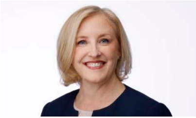
Hon. Lisa RAITT Coalition for a Better Future

The Honourable Lisa Raitt serves as the co-chair of the Coalition for a Better Future, a diverse group of Canadian leaders and organizations spanning business, labour and civil society – working together to achieve a long term plan for economic growth that is inclusive and sustainable. Ms. Raitt brings a wealth of experience from both the public and private sectors. She was elected into the House of Commons in 2008, where she went on to hold three senior portfolios serving as Minister of Natural Resources, Minister of Labour, and Minister of Transport.