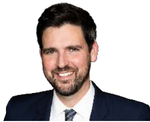
Hon. Sean FRASER Federal Minister of Housing and Infrastructure