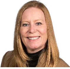
Hon. Jill GREEN

Minister of Social Development and NB Housing, NB