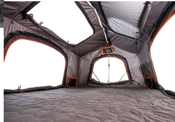
Skylights and Rope Light!