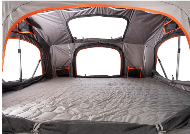
Ventilation and pockets!