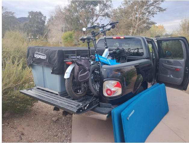
Bikes fit alongside camper!