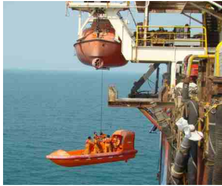
Rescue Boat Commissioning

LIFEBOATS, RESCUE BOATS, AND THEIR LAUNCHING APPLIANCES SERVICES