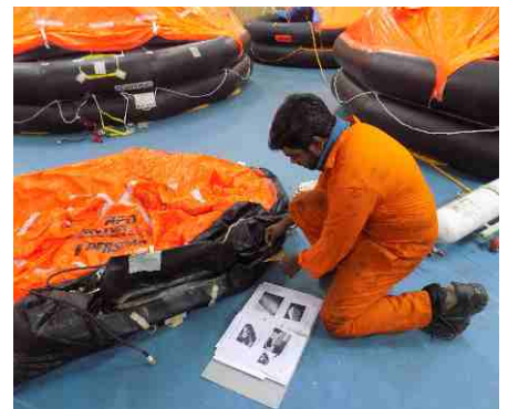
Inspection as per OEM manual