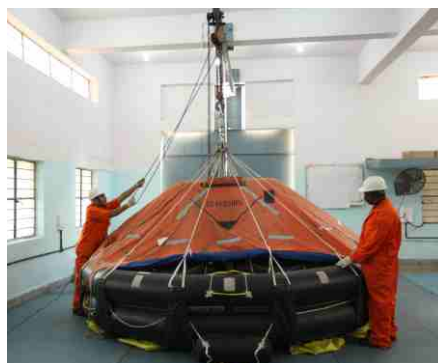
Davit Launched Liferaft Test