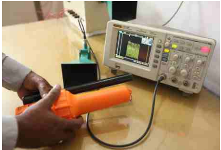
Oscilloscope Reading of Rescue SART