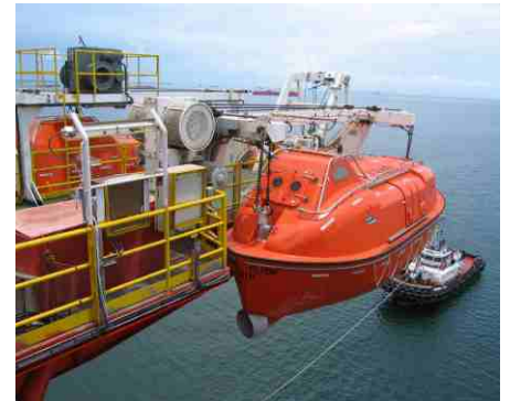
Platform Davit Installation