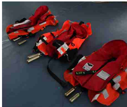
Gas Cartridge Replacement

SHM's service facilities are approved for fulfilling your lifejacket service needs.