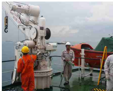
Single Arm Davit Winch Inspection