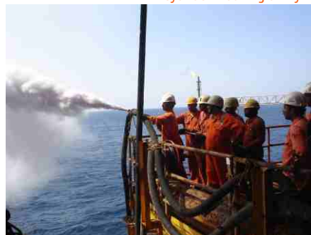
DCP Skid Commissioning