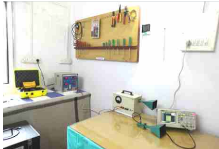
Servicing Workshop Facilities