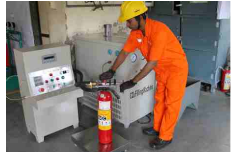
Co2 Extinguisher Refilling