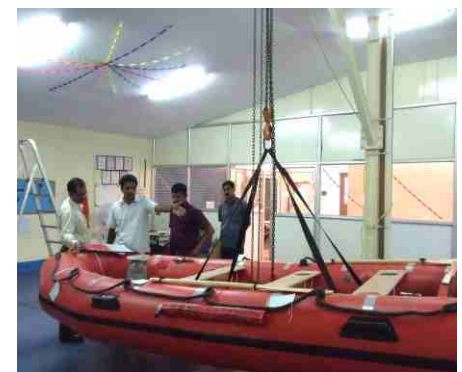
Pressure Test at Service Station