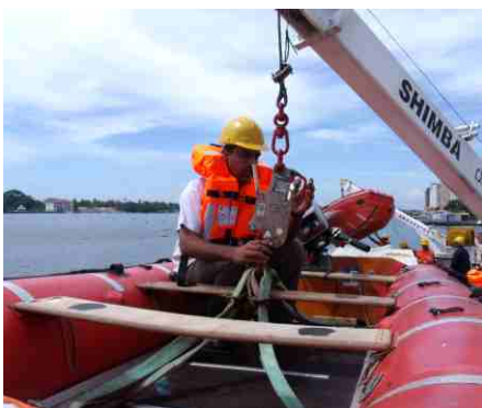
Release Hook Inspection