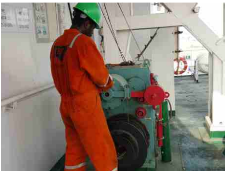
Winch Brake Inspection