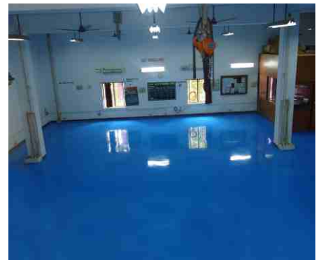
Liferaft Service Station