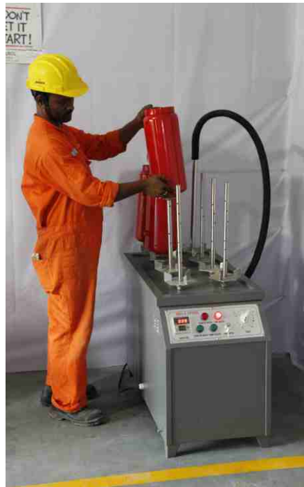
Cylinder Washing & Drying