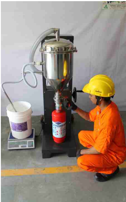
DCP Extinguisher Refilling