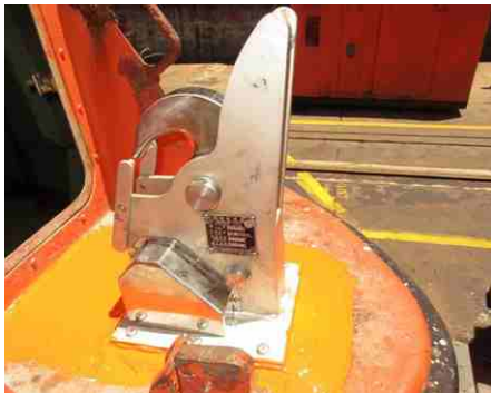
New Hook on FRP Foundation