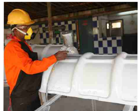
Liferaft Container Painting