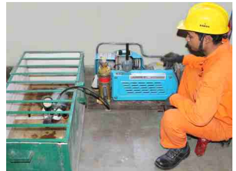
SCBA & EEBD Bottle Refilling