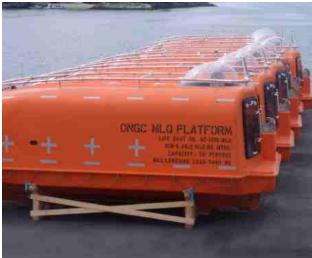
New Lifeboat Delivery