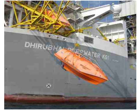
Life Boat Installation