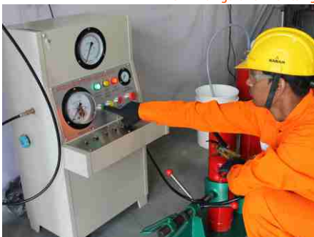
Nitrogen Filling & Gauge Check