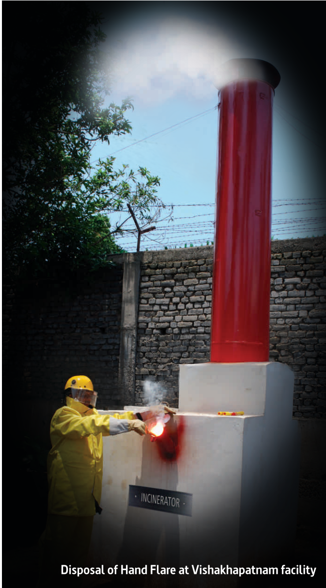
Disposal of Hand Flare at Vishakhapatnam facility