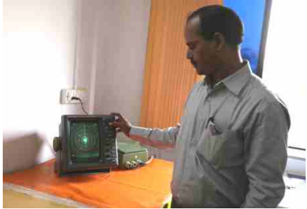
GMDSS Rescue SART Testing