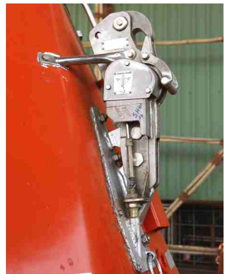
New Hook on SS Foundation