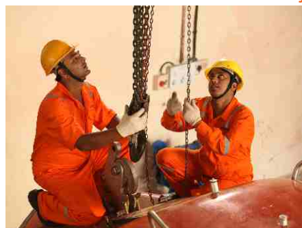
Release Hook Servicing