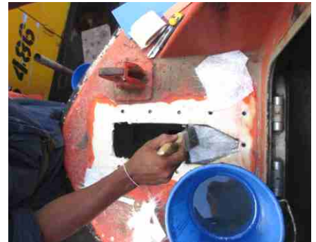
FRP Foundation Construction