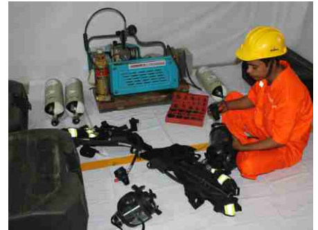
SCBA & EEBD Maintenance and Repair