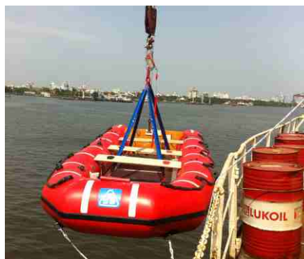
Rescue Boat Launch Test