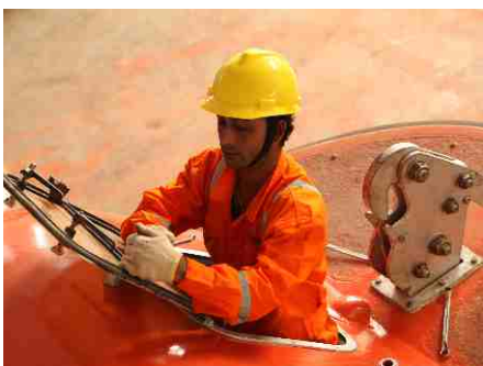
Lifeboat Exterior Repair