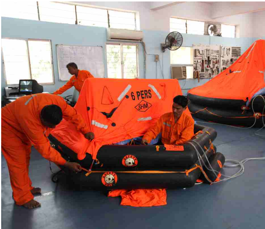
Liferaft Servicing at Service Station