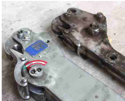
New vs Old Hook