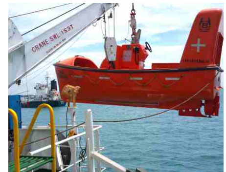
Dynamic Winch Brake Test