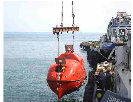
Lifeboat Load Test