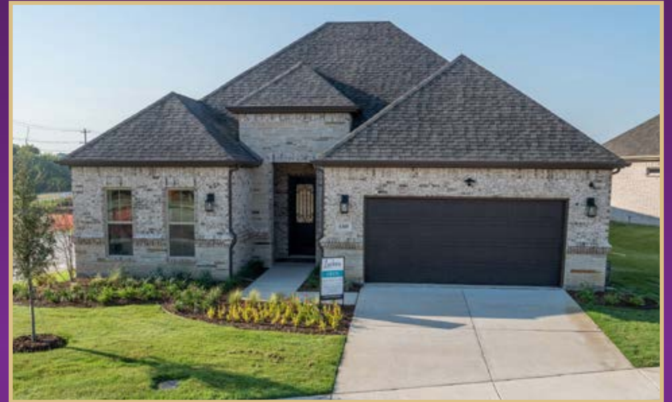
The Carmina Model at Ladera Prosper Integrity Group