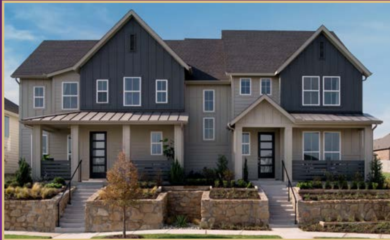
Poppy & Chicory - Terrace Collection Tri Pointe Homes Designed by GMD Design