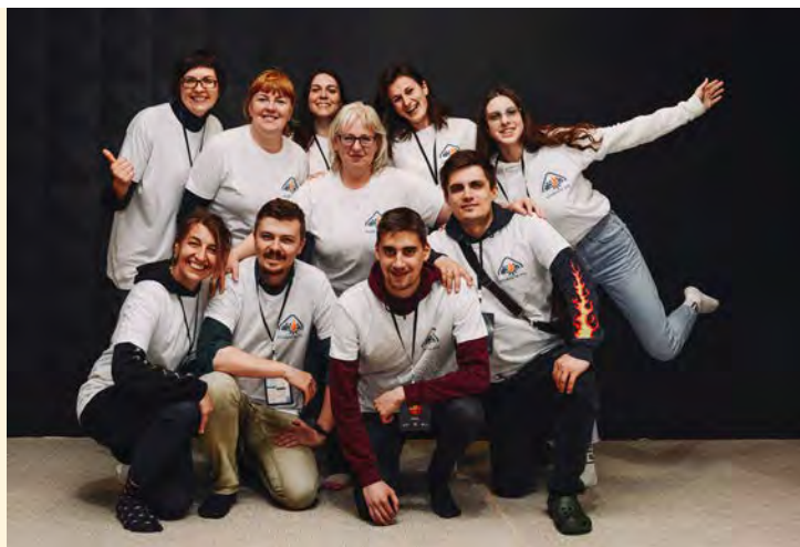
Group Leaders at a CCI/Ukraine Seminar

Abundance Canada W1125G 12-1325 Markham Road Winnipeg MB R3T 4J6