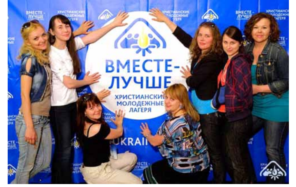
Better Together Christian Youth Camps Camp Gloria staff who attended CCI/Ukraine STW

"While I was on the train I felt confident and happy but when I arrived at the campsite I was worried. All the memories from 2003 surfaced – that was the time when I came to STW as an inexperienced 19 year-old girl. It was my very first STW with CCI and they have given me a start. I became a good facilitator. CCI had ignited a camp ministry fire that is still burning in my life. At first, our camp copied the structure proposed by CCI. Over the years, we developed our own camp, our own rules, the administrative system, and much more. But CCI gave us the start when we knew nothing about camp and how to start a camping ministry.