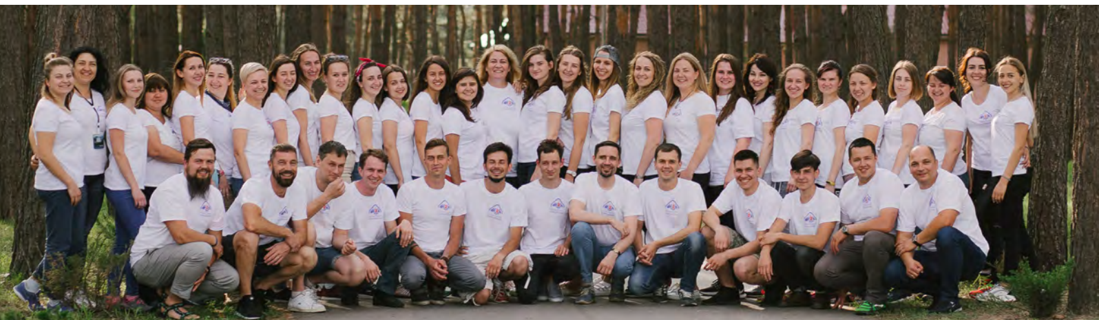
Group Leaders at the CCI-Ukraine STW in May 2018