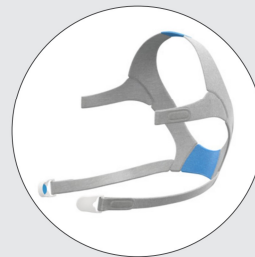
AirFit F20 headgear with headgear clips 63470 (S) 63471 (Std) 63472 (L)