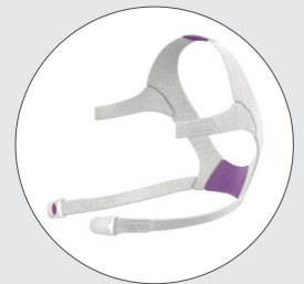
AirFit F20 for Her headgear with headgear clips 63473 (S)