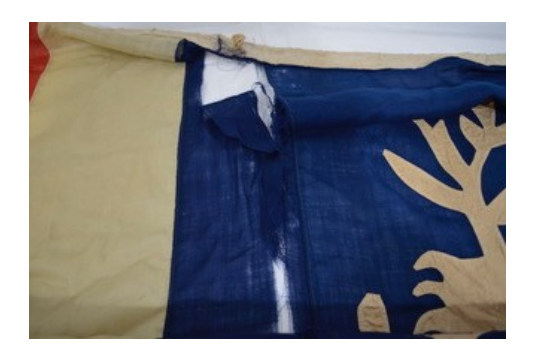
Damage to flag before repairs