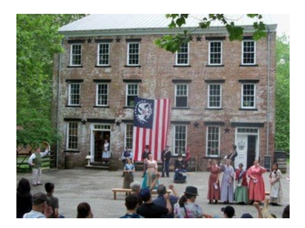
General Store at Allaire Park with flag 2018