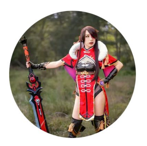
What's in store....

Our start began in mid-September upon attending Colossalcon East 2022 at Kalahari Resorts in Mount Pocono, PA. The wonderful atmosphere and amazing cosplayers solidified my feeling that this was something I have been missing all my life.