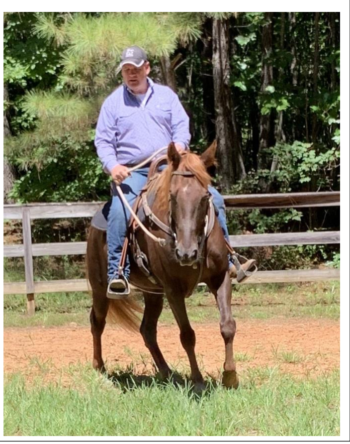
For a full schedule of Carl's upcoming clinics and events check the Just Gait FaceBook page