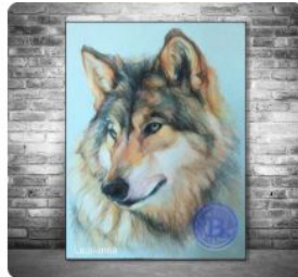
WOLF OF CRYPTO 16