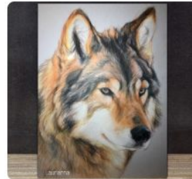
WOLF OF CRYPTO 15