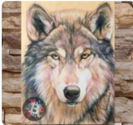
WOLF OF CRYPTO 17