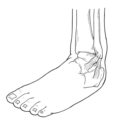
Injured ankle with laxity of ligaments

surgeon will ask you about any previous ankle injuries and instability. Then he or she will examine your ankle to check for tender areas, signs of swelling, and instability of your ankle as shown in the illustration. X-rays, CT scans, or MRIs may be helpful in further evaluating the ankle.