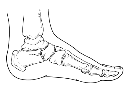
Normal pediatric foot