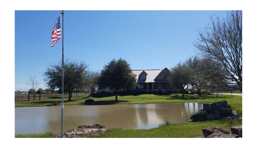
Main Campus 26111 Beckendorff Road Katy, TX 77493 www.srsem.net

(346) 214-9199 <a href="mailto:srtcshouston@gmail.com">srtcshouston@gmail.com</a>