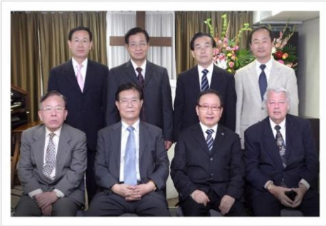
Founding members - October 4, 2008