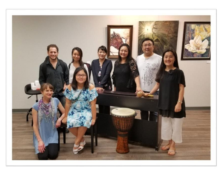
Worship Arts Team