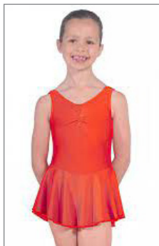
Upper Infants Red