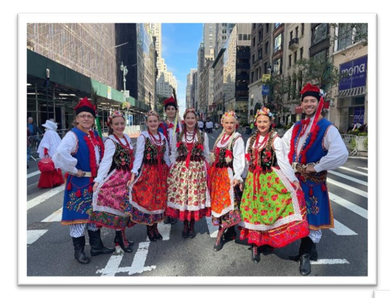
Pułaski Parade 2021