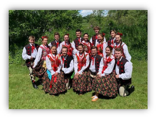
Tatry Song & Dance Ensemble 50 years