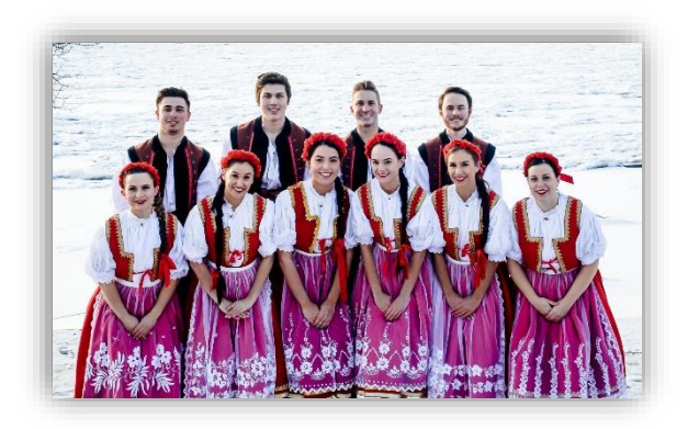
Polish Folk Dance Ensemble Iskry 55 years