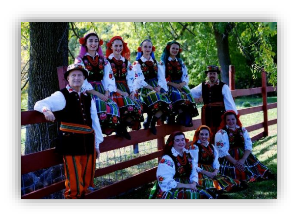
Polish Heritage Dancers 25 years