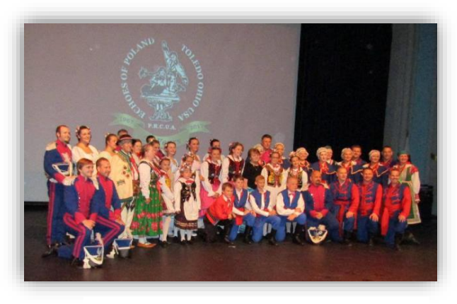
Echoes of Poland Song & Dance Ensemble 55 Years

These member groups will be celebrating milestone anniversaries in 2022. Futher information regarding their anniversary concerts will be published in our next newsletter. Congratulations to you all!