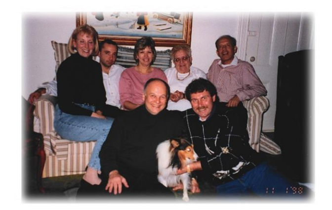
A visit to New York