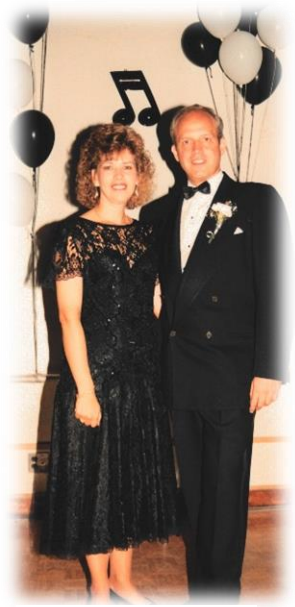
1990 Long Island PFDAA Festival