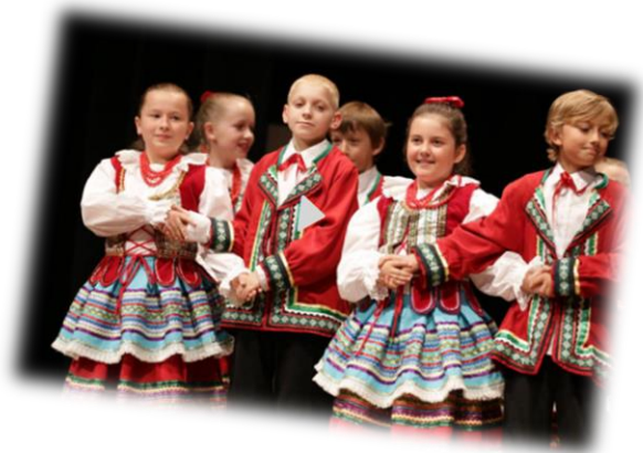
Juniors Largest group 7 - 12 years old