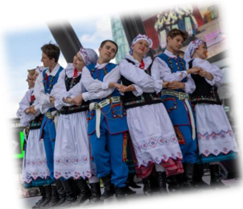
Intermediate 13 - 17 years old