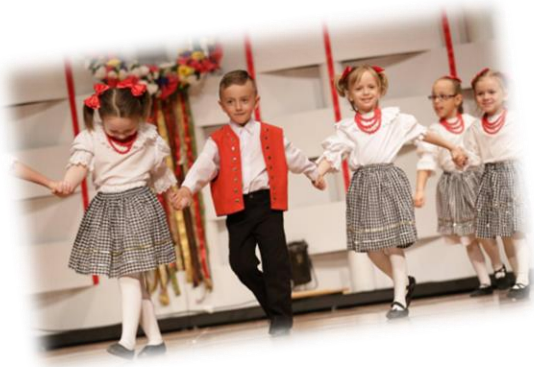
Mini Juniors - youngest members 4 - 6 yrs old