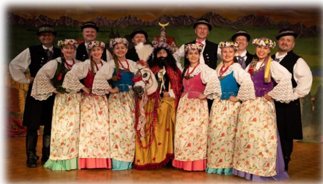
Sokoły-Joy Parent division of Radość