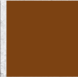
Cinnamon 10lbs per CY