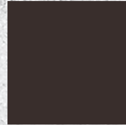
Charcoal 20lbs per CY