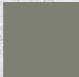
Salt Lake Gray 15lbs per CY