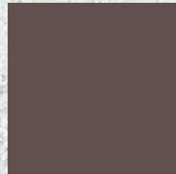
Greystone 10lbs per CY