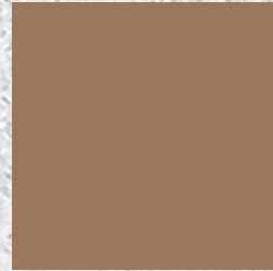
Camel 10lbs per CY