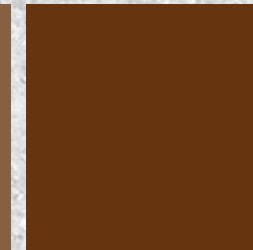
Old Brick 20lbs per CY