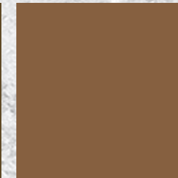
Nutmeg 20lbs per CY