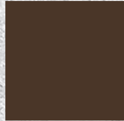
Bristol Brown 25lbs per CY