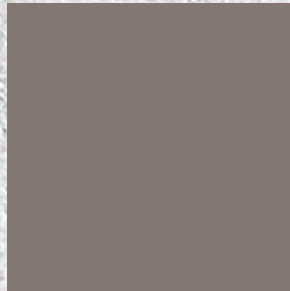
Smoke 5lbs per CY