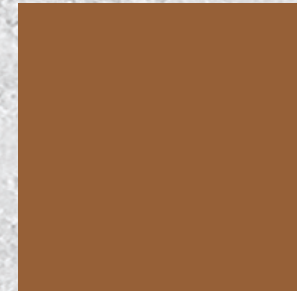
Augusta Gold 15lbs per CY