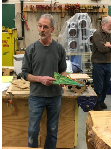
Sample of aniline dye finishing.