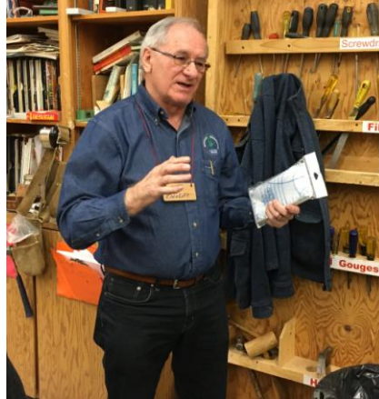
Silicone baking mat useful as non-skid