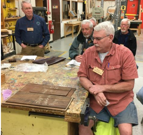
Brazilian Rosewood veneers