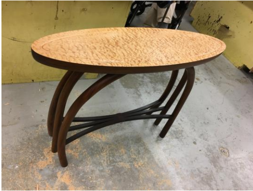
Solid 'beveled edge' quilted maple and walnut table