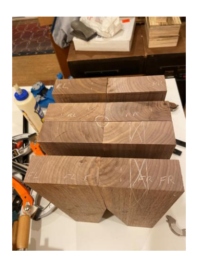
Castle joint 'Thuma' bed legs