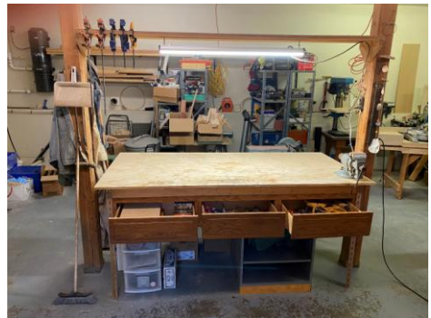
Main work bench/table, tools under. Drawers repurposed from oak bed.