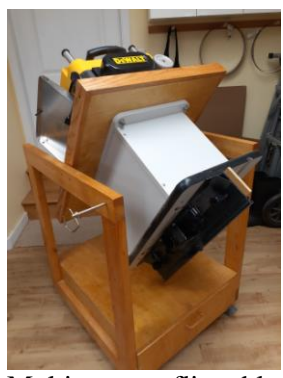
Multipurpose flip table.