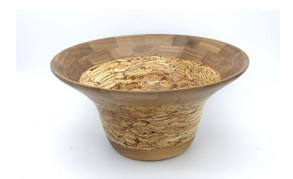
Laminated Strand Lumber (LSL) and walnut fruit bowl. (Approx. 10.5" in diameter and 5" high)