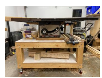
Table saw table.