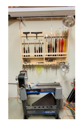
Garage/workshop, everything on wheels, big storage/shelving unit, rack for turning tools.