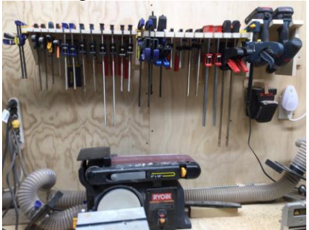
Slotted shelf clamp storage.