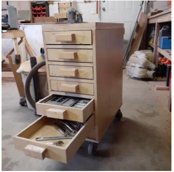
Wheeled chest full of tools.