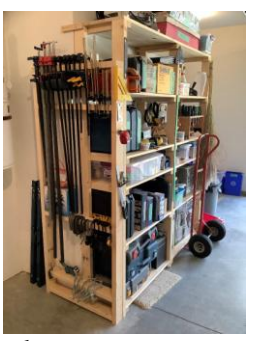
Two car garage; everything on casters and around the walls. Multi-use shelving & clamp storage.