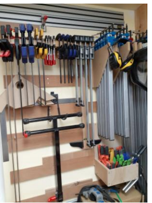
Wall hanger (45° plywood) for clamps, etc.