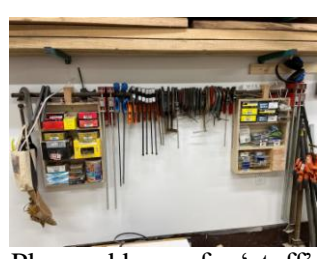
Plywood boxes for 'stuff'.