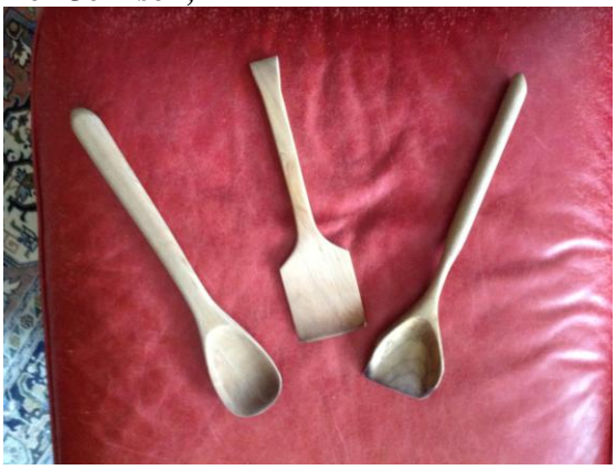
Spoon, Spatula and a combination of the two made from Maple. All are strictly utilitarian and used every day.