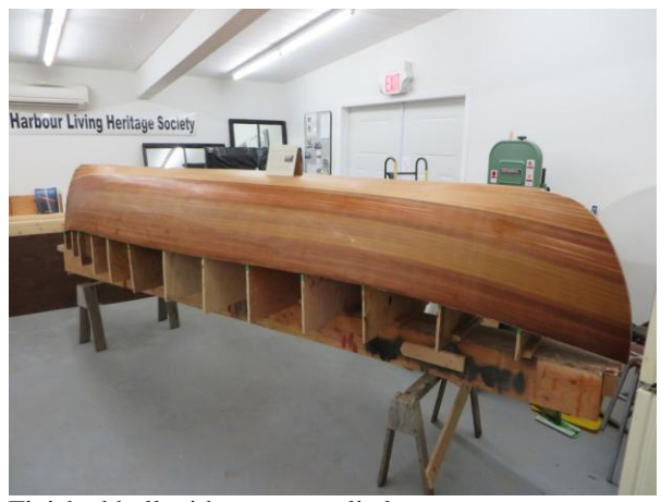
Finished hull with epoxy applied