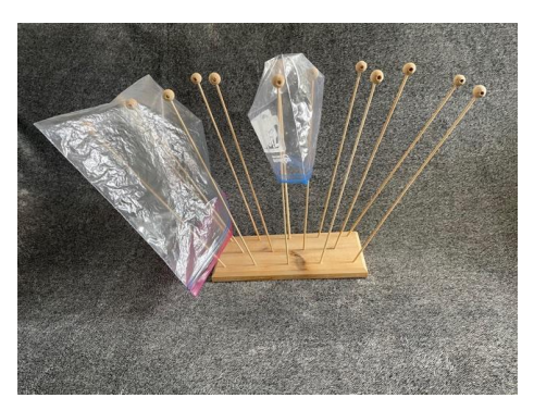
Zip-Lock bag 'drying rack'. Bamboo skewers for the uprights with 5/8" beads for the tips fastened into a cedar base.