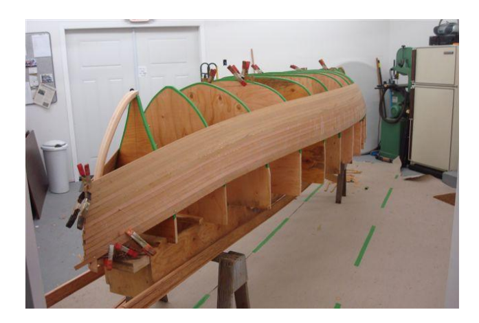
The building form (strong back) and the first four strips on each side. Strips half way up