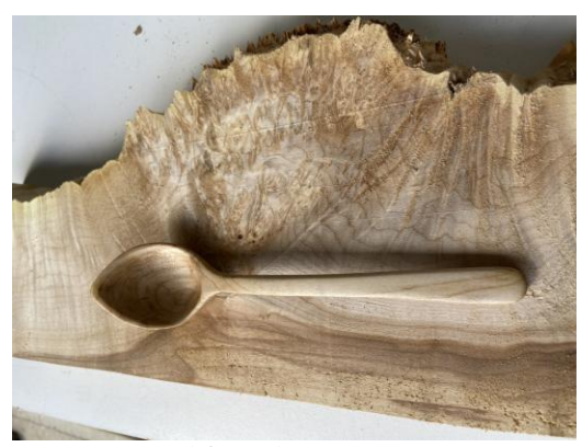
A spoon carved from the same tree