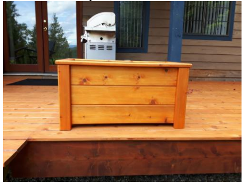
1x6 red cedar planter box

Showed cedar planter boxes made from leftover material from a deck replacement.