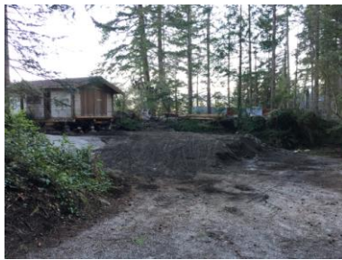
Crane platform ready