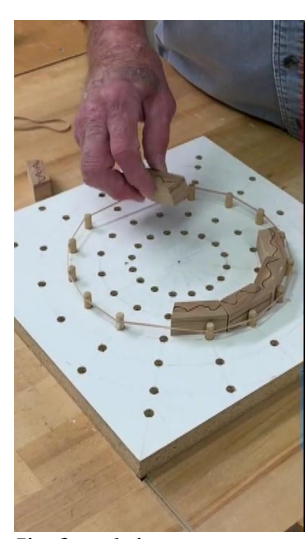
Jig for gluing segments