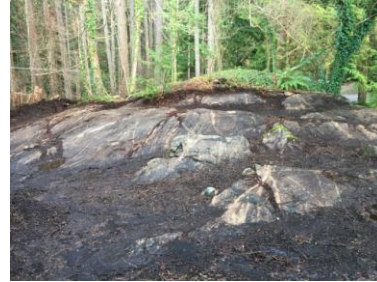
Site prep, new location