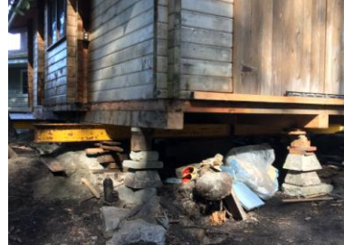
Steel beams in place ready to lift