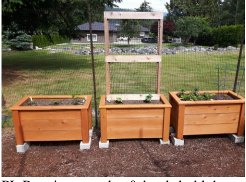
PL Premium, staples & brads hold them together