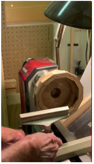
Turning the inside