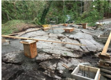
Layout of new pylons