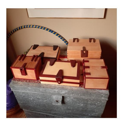
Provided a photo of a collection of wooden boxes.