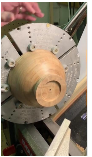
Setup for turning the outside