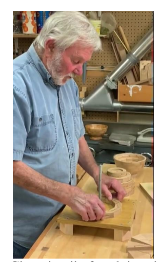
Clamping jig for gluing rings