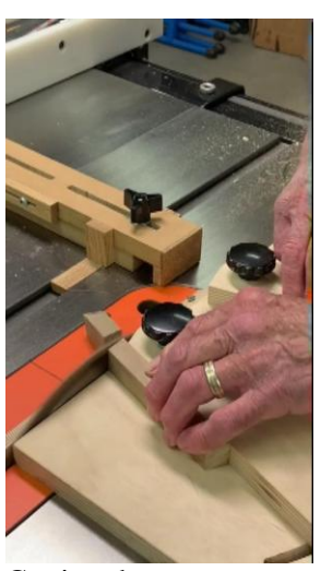
Cutting the segments

The video was shot in Norm's workshop in his house and broken into parts pertaining to the various steps involved. A few images from the presentation as follows;