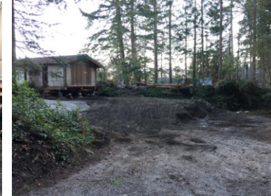
Crane platform ready