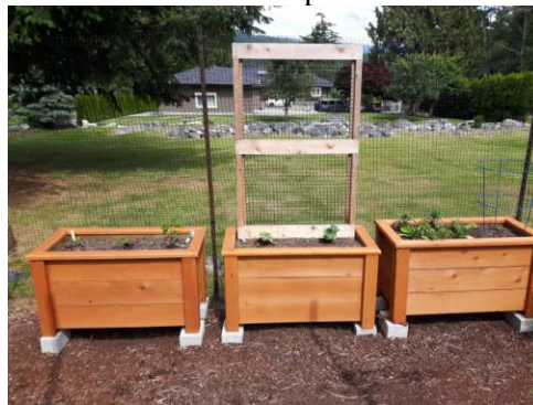
PL Premium, staples & brads hold them together