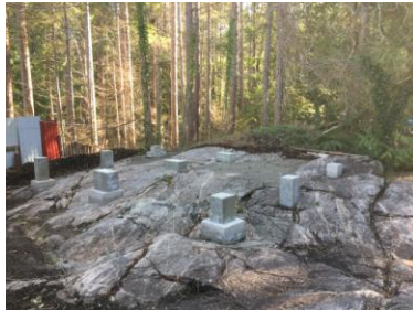
Completion of new pylons