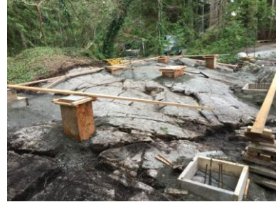
Layout of new pylons