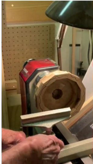
Turning the inside