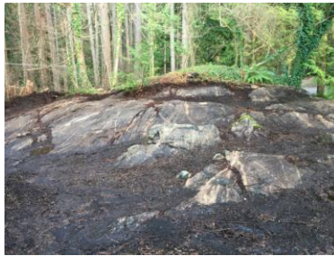
Site prep, new location