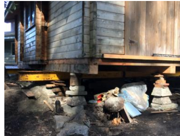
Steel beams in place ready to lift