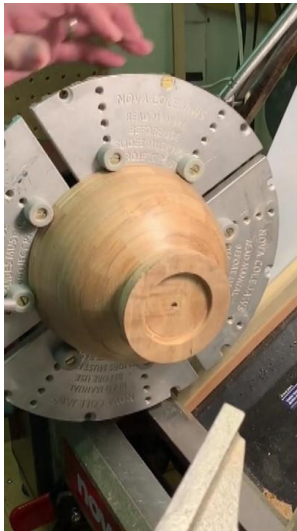
Setup for turning the outside