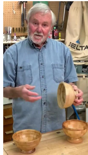
The finished products

The complete video can be viewed at; https://youtu.be/pS00EbM5d-o