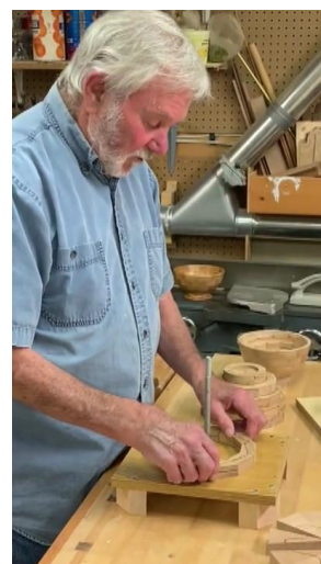
Clamping jig for gluing rings