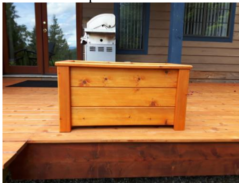
1x6 red cedar planter box

Showed cedar planter boxes made from leftover material from a deck replacement.