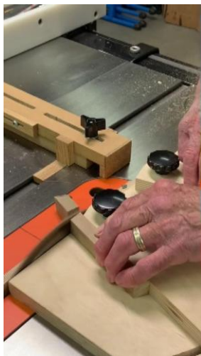
Cutting the segments

The video was shot in Norm's workshop in his house and broken into parts pertaining to the various steps involved. A few images from the presentation as follows;