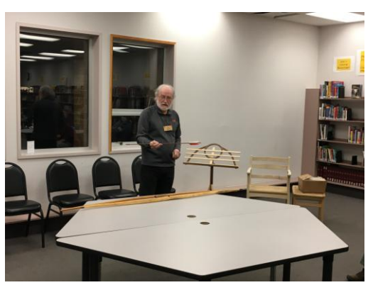
Arrows made of Japanese arrow bamboo