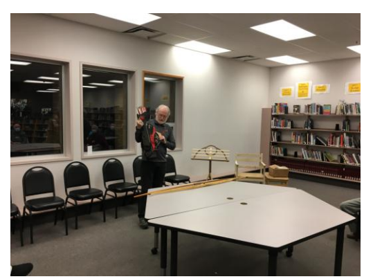
The perfect quiver