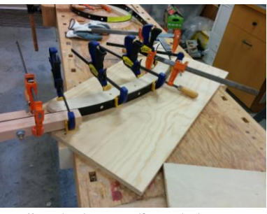
Bending the 'steamed' maple legs