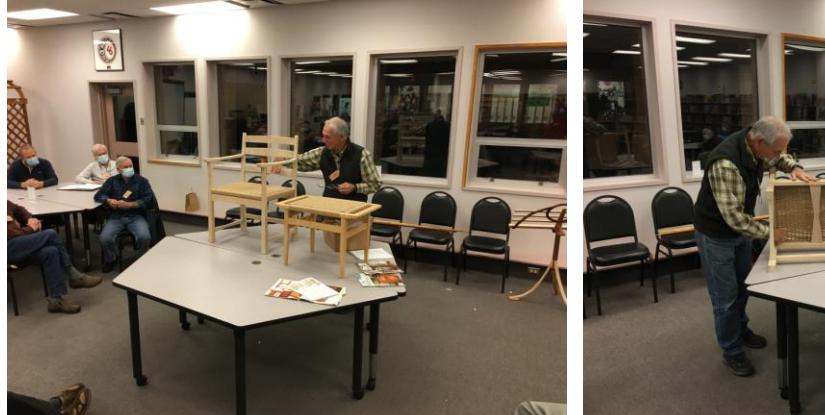
Describing the features and design process

The chair and bench are made from local Big Leaf Maple with Danish Cord woven seats. I found the design ideas from projects viewed in Fine Woodworking magazines and adapted 2 different designs in the final chair design. The main focus of the presentation was to discuss the pleasures of doing Danish Cord weaving. The two projects had two different weaving styles. The chair has a standard style using concealed L shaped nails to hold the cord and the bench is a split rail weaving style in which nails are not needed for the weave portion. The finishing technique of bleaching wood to remove colour prior to the finish was used on the chair then both pieces were waxed.