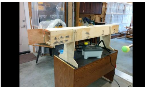
Steam box and steamer bought from Lee Valley