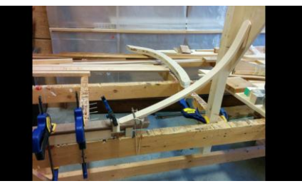
Set up for cutting top and bottom of the legs