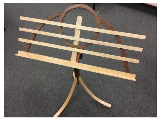
Finished music stand