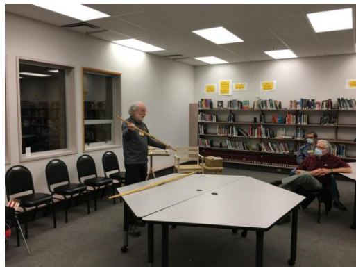
'Flat' bow in hand