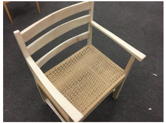
Bleached blond chair