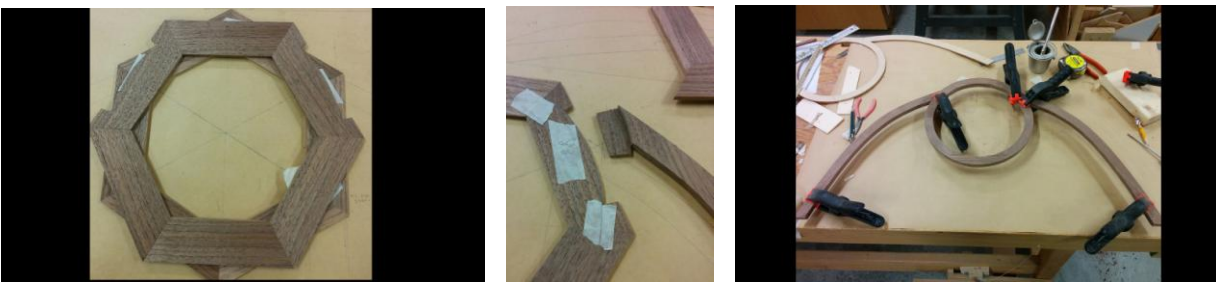
Rough cutting and gluing the circle made of walnut Circle to arm connection