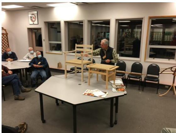
Describing the features and design process

The chair and bench are made from local Big Leaf Maple with Danish Cord woven seats. I found the design ideas from projects viewed in Fine Woodworking magazines and adapted 2 different designs in the final chair design. The main focus of the presentation was to discuss the pleasures of doing Danish Cord weaving. The two projects had two different weaving styles. The chair has a standard style using concealed L shaped nails to hold the cord and the bench is a split rail weaving style in which nails are not needed for the weave portion. The finishing technique of bleaching wood to remove colour prior to the finish was used on the chair then both pieces were waxed.