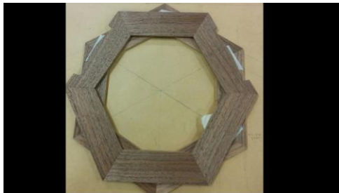
Rough cutting and gluing the circle made of walnut