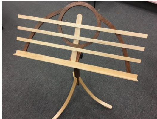
Finished music stand