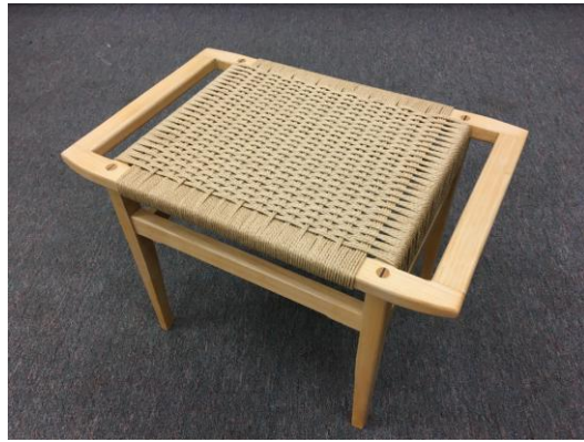
Bench with 'double rail' weave