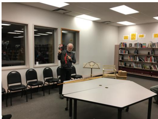
The perfect quiver