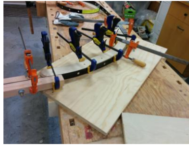
Bending the 'steamed' maple legs