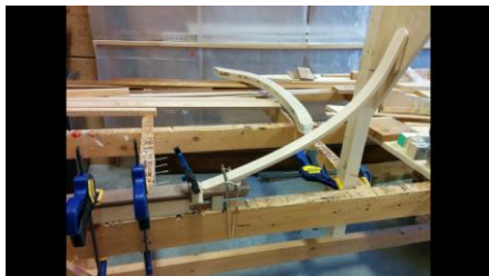
Set up for cutting top and bottom of the legs