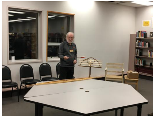
Arrows made of Japanese arrow bamboo