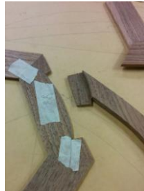
Circle to arm connection