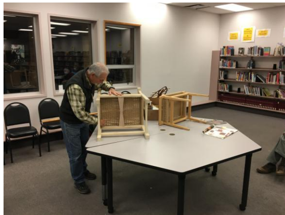
Explaining the weaving methods