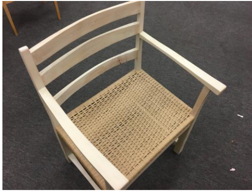
Bleached blond chair