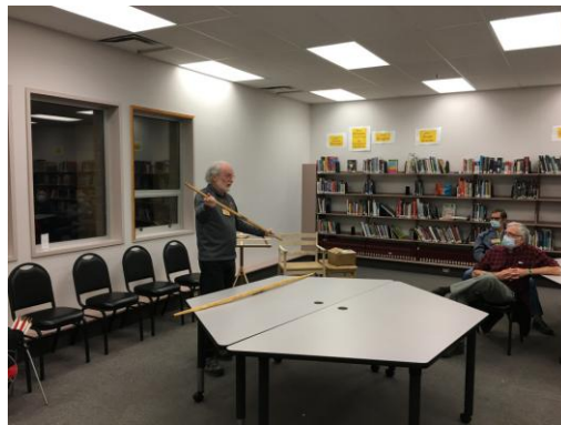
'Flat' bow in hand