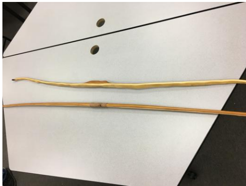
'Long' bow is the bottom one