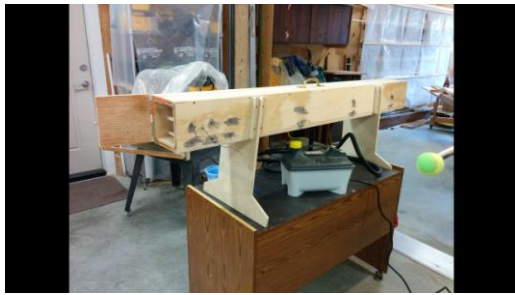
Steam box and steamer bought from Lee Valley