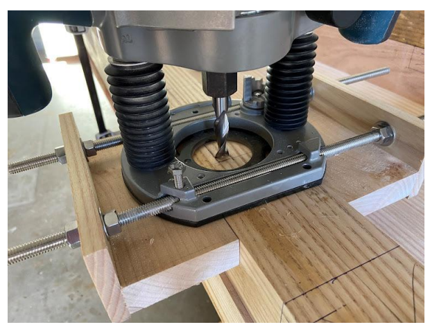
Few of the set-ups and jigs used to cut holes, make mortise & tenons, etc.