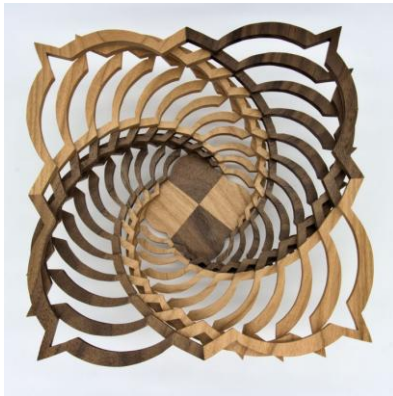
Example of a spirally layered bowl with four sections of alternating colours using 1"x 6" S4S hardwood lumber