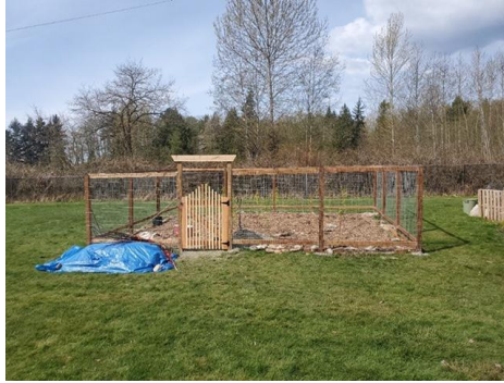
Finished deer fence