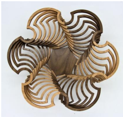
Example of a pattern made up of 6 segments of alternating cherry and walnut