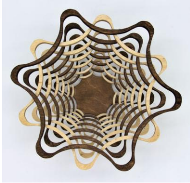
Example of staining of every second layer/ring