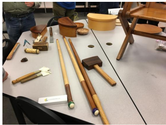
Display of items made over the years (Bentwood boxes, walking sticks, mallets, etc.)