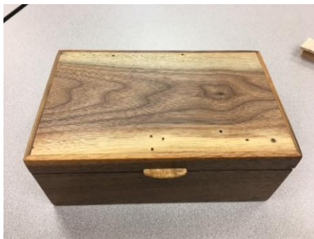
Small box made of walnut exhibiting imperfections in the wood