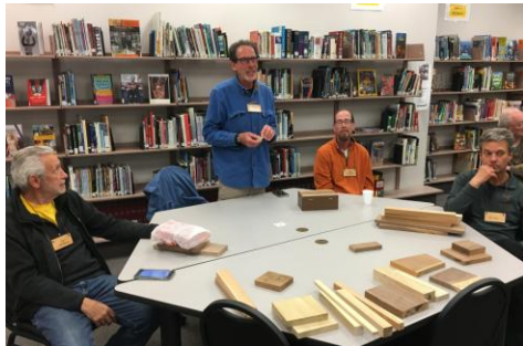
Speaking about his approach to woodworking