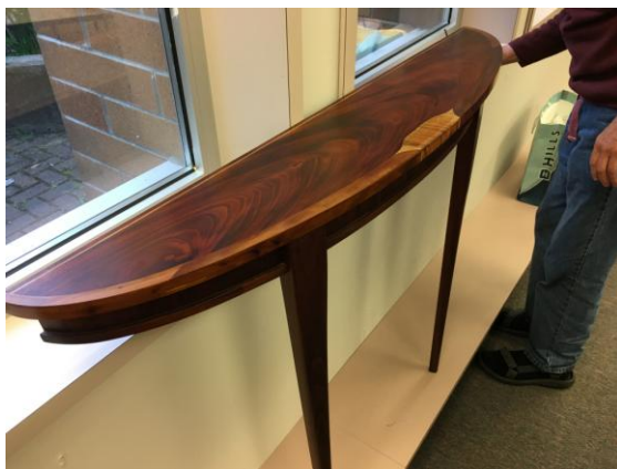
'Hanging' veneered bow front table