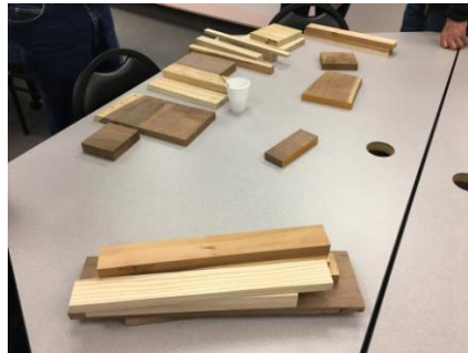
Donated cut-offs of various hardwoods