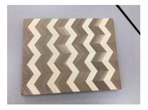
Chevron design cutting board