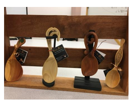
Examples of decorated handles