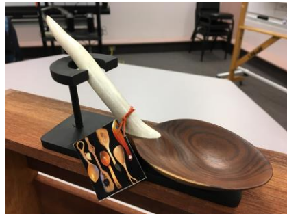
Antler handle on walnut