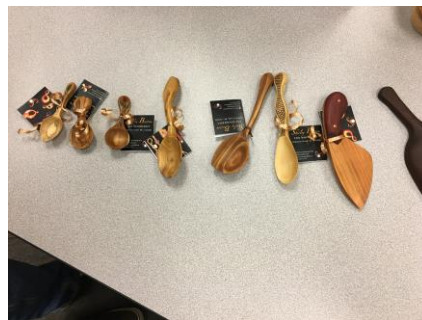
Range of sizes and shapes