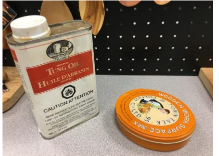
Tung oil and orange wax

Shirley has been carving for four years and each utensil takes on average three afternoons to make.