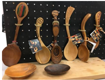
Variety of shapes, sizes and decoration treatments.