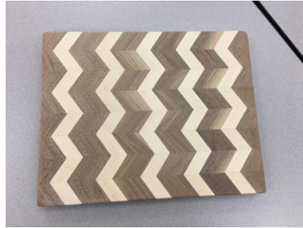
Chevron design cutting board