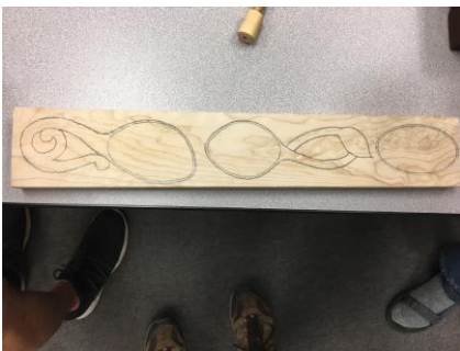
Sketches on 'blank'

To start a carving project Shirley takes a piece of wood or 'blank' and draws the shape. Then gouges out the relief/spoon depression before roughing the shape with either a band saw, hatchet or draw knife. (Sometimes a lathe). If the piece is to be decorated she cuts, chip carves and/or burns in the design (often Māori of origin). Finishing is done with many cutting, filing and sanding implements. Shirley's favorite finishes are tung oil and orange wax.