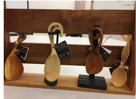
Examples of decorated handles