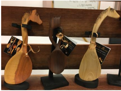
Horse head spoons