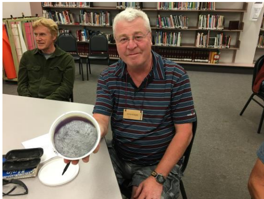
Left over hardened epoxy,.....anyone want it ?