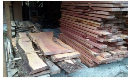
Wood Recovery Program

The Vancouver Island Woodworkers Guild is a non-profit organization of approximately 150 professional and amateur woodworkers dedicated to the promotion of woodworking and the appreciation of fine craftsmanship in the southern Vancouver Island region.