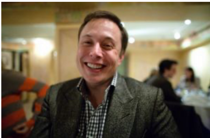
Elon Musk , Tesla, SpaceX