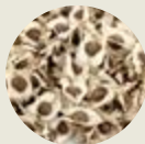
Moringa Seeds With Wings