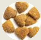
Moringa Soft Chews for Cats and Dogs