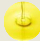
Moringa Liquid Extract