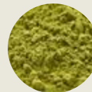
Moringa Fruit Powder