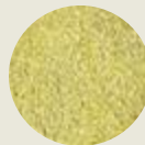
Freeze Dried Moringa Powder