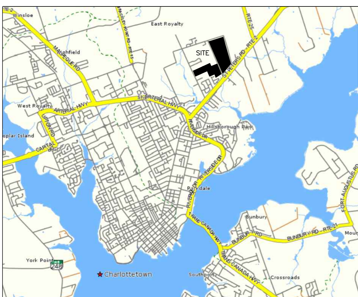
KEY PLAN N.T.S.