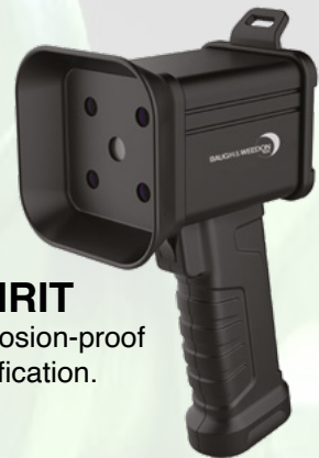
SPIRIT Explosion-proof certification.