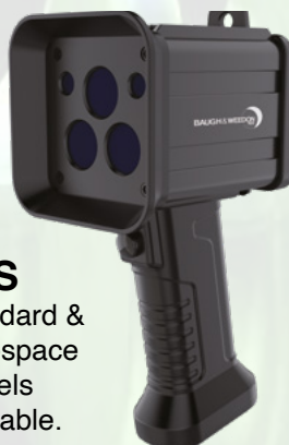
IRIS Standard & Aerospace models available.