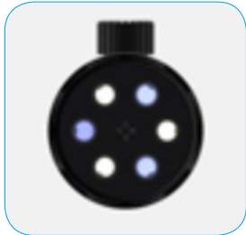
UV/White Light Endoscope