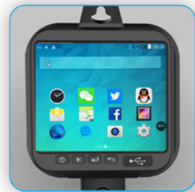
Android Based O/S