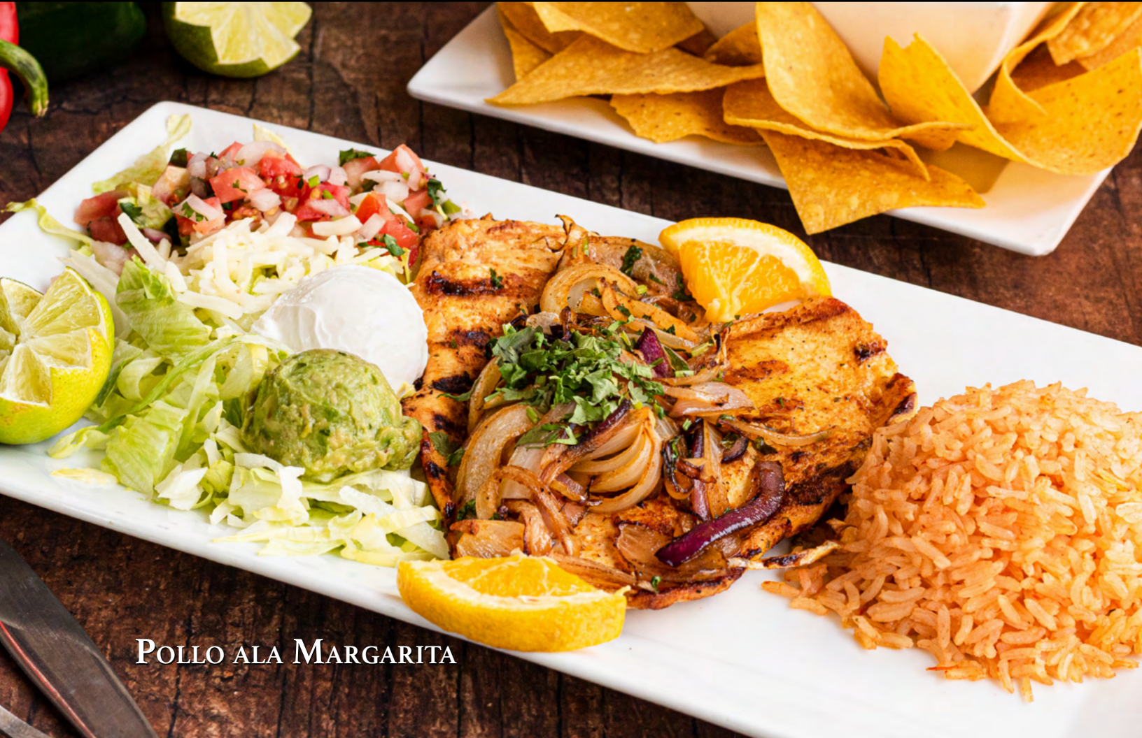
POLLO ALA MARGARITA