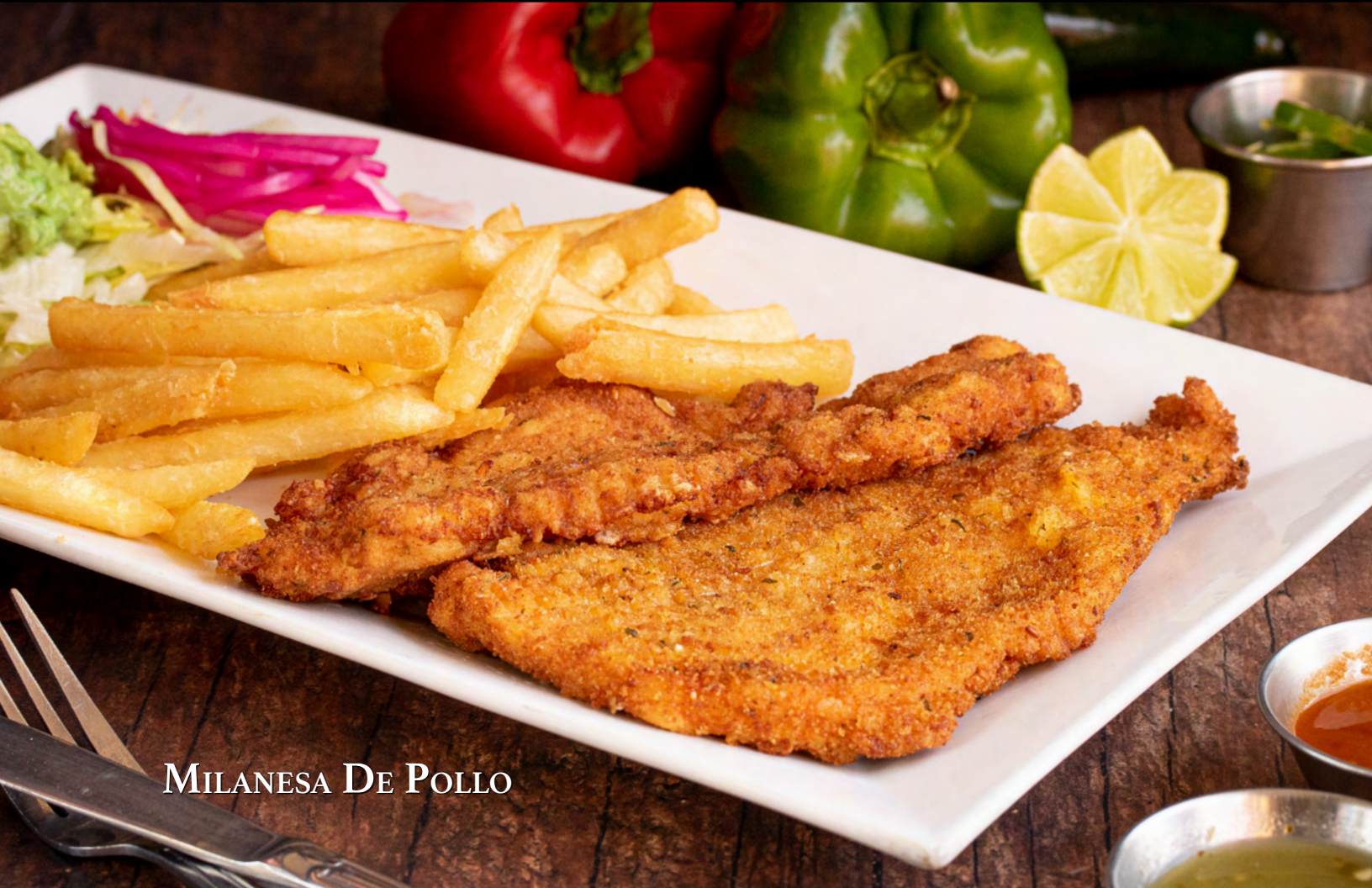
MILANESA DE POLLO