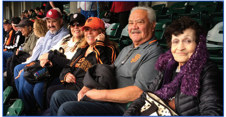
San Francisco Giants Game 4/11/2018