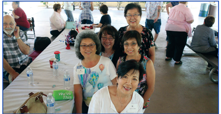
RPESJC Annual Picnic 6/14/2018