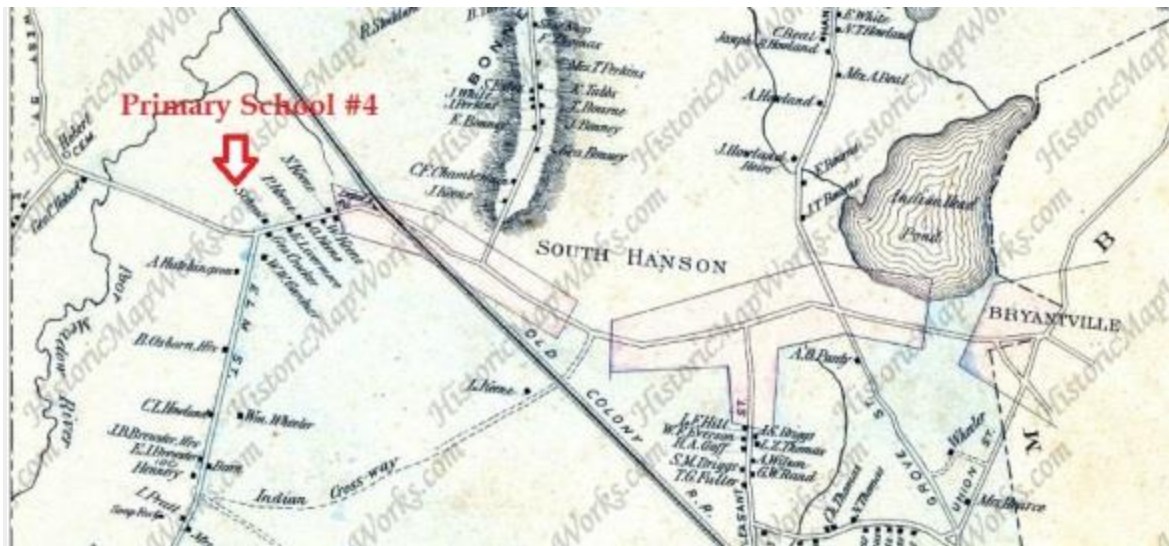
#4 Primary Schoolhouse on Main Street in the 1879 George H. Walker Plymouth County Atlas.