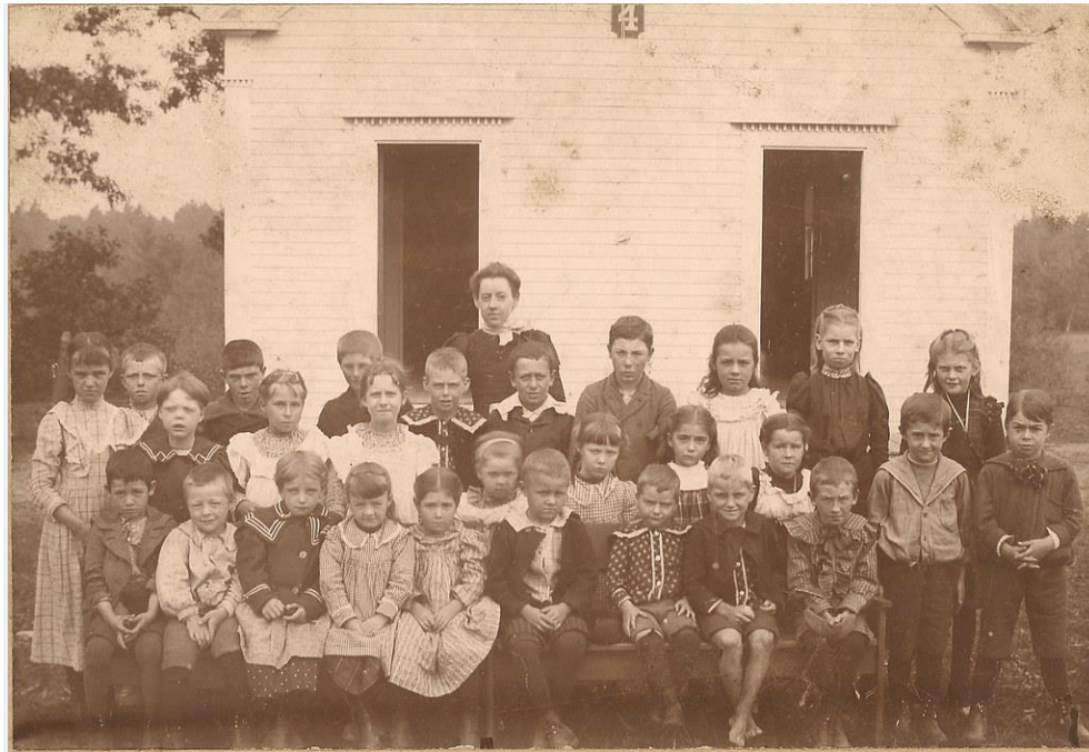
Primary School #4, Hanson, c. 1899